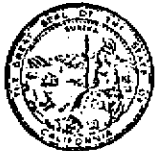
Exhibit 1 (continued)