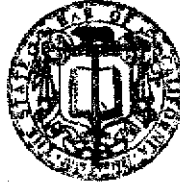
EXHIBIT I THE STATE BAR OF CALIFORNIA